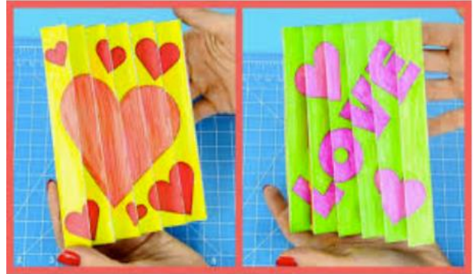
Ex- Two image Aganograph