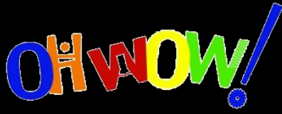
Exhibit Challenge Card Lego Table

Challenge: As an individual work to construct the most original version of an object selected by your groups chaperone. (Plane, House, Boat, etc.)