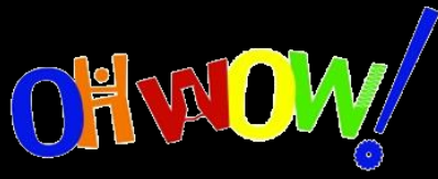
Exhibit Challenge Card Brain Quiz

Challenge: to receive a PERFECT Score on one of the four Quiz shows dealing with Financial Literacy.